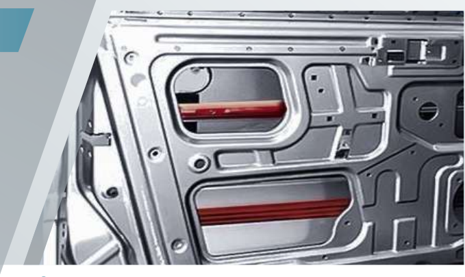
Anti-Collision Steel Beam in Door