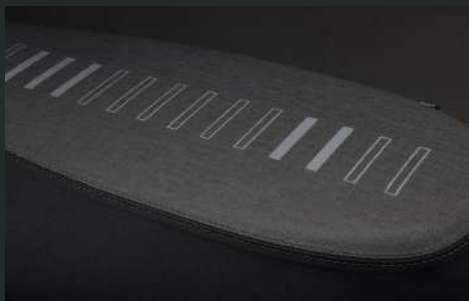
Waterproof Seat Cushion