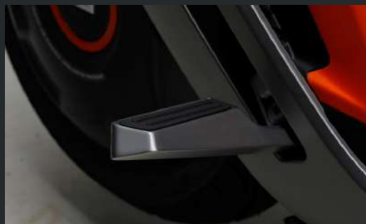
Hidden rear pedal