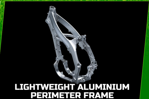
LIGHTWEIGHT ALUMINIUM PERIMETER FRAME