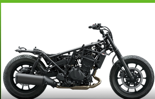
LIGHTWEIGHT TRELLIS FRAME