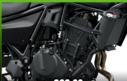
FUEL-INJECTED 399 CC PARALLEL TWIN ENGINE