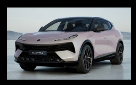
BLOSSOM GREY OPTION ELETRE S ELETRE R