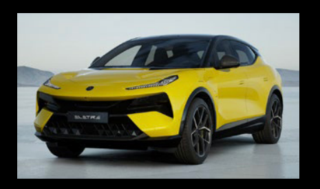
SOLAR YELLOW OPTION ELETRE S