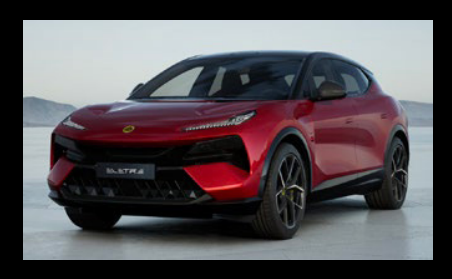
NATRON RED OPTION ELETRE S ELETRE R