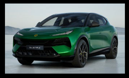
GALLOWAY GREEN OPTION ELETRE S ELETRE R