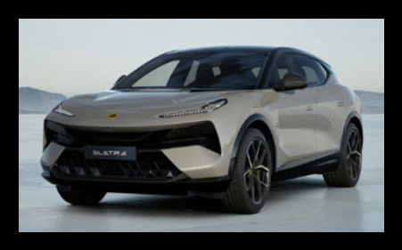
KAIMU GREY STANDARD ELETRE S ELETRE R