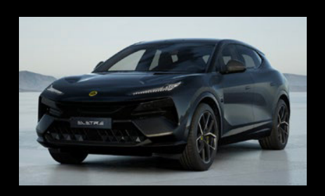
STELLAR BLACK OPTION ELETRE S ELETRE R