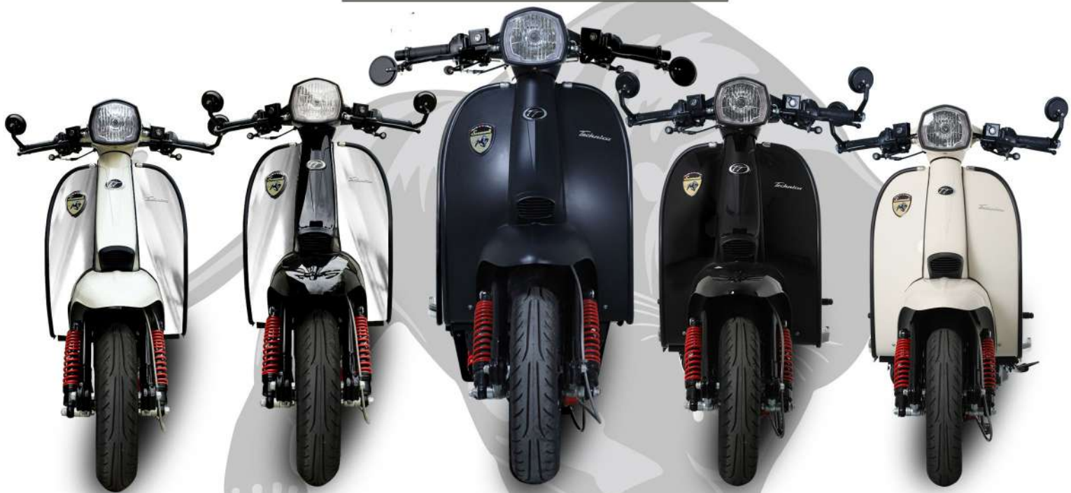
Old English White Chrome